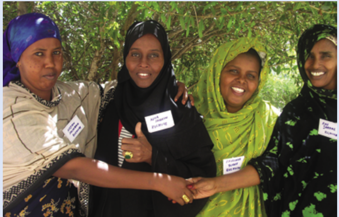
Somaliland party officials take part in a multiparty campaign strategy workshop held December 2004.

IRI continued to work with its local partner, Citizens Against Violence, to dissuade young