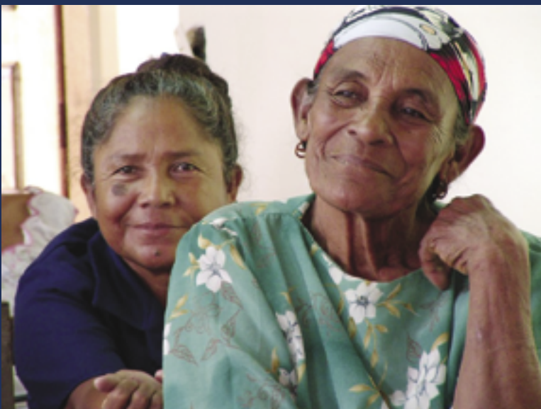
Women participate in an IRI civic and political participation workshop in Nicaragua.