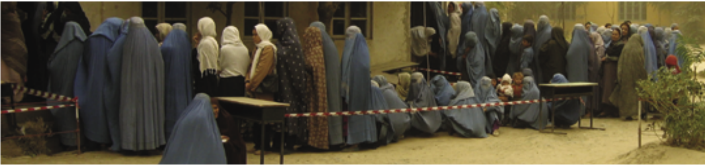
Women line up to vote during Afghanistan's October 2004 election.

In a breathtaking show of support for democracy, more than eight million Afghans – both men and women – lined up for hours to cast votes despite threats of violence.