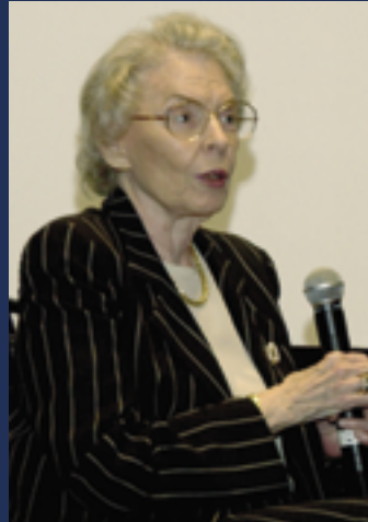
Dr. Jeane J. Kirkpatrick speaks at IRI's foreign policy forum on August 30, 2004.

This substantive forum was made possible through the generous support of Time Warner, Inc., ChevronTexaco and AT&T.