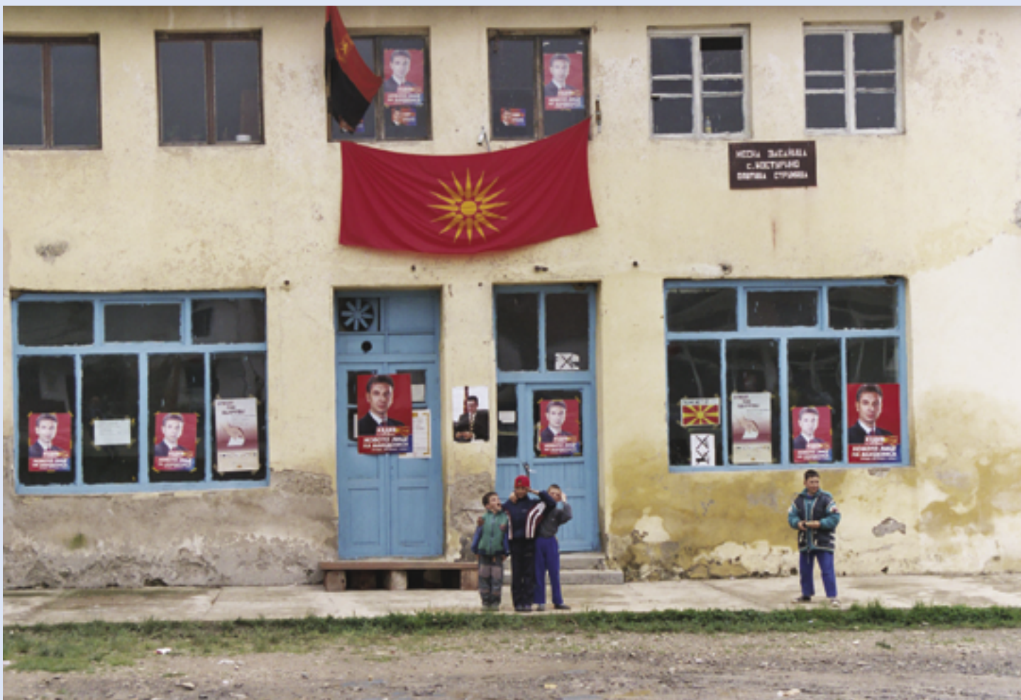
Children pose before a Macedonian polling center in the district of Strumica.