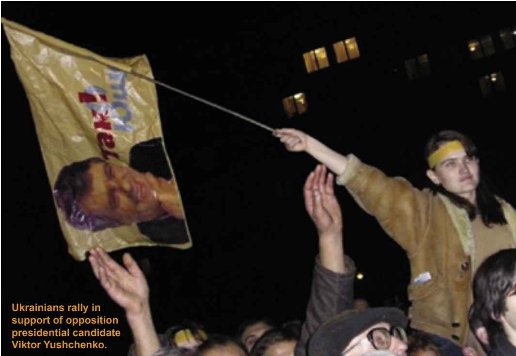
Ukrainians rally in support of opposition presidential candidate Viktor Yushchenko.

For nearly a month, Ukrainians of all ages gathered and camped out in Kyiv's Independence Square and across the country to defend their votes.