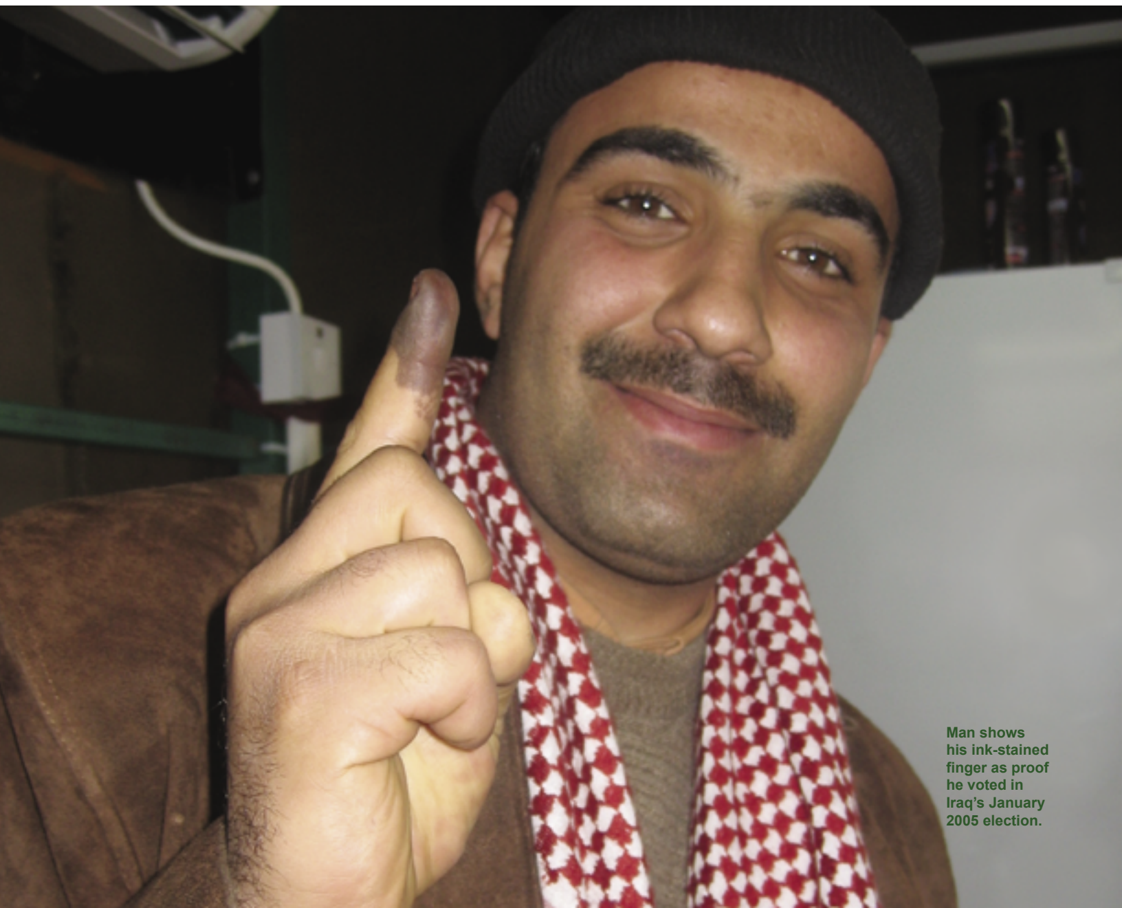
Man shows his ink-stained finger as proof he voted in Iraq's January 2005 election.

For the people of Iraq, January 30 represents an accomplishment that may one day be regarded as among the greatest in their nation's long and storied history.