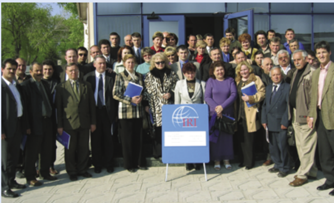
Moldovan political party activists pose for a photo during a campaign development training seminar conducted by IRI in April 2004.

IRI conducted "communicating with the electorate" training for campaign staff from five registered parties and for six independent candidates in three cities prior to the December 2004 lower house elections. To offset government interference in IRI's work with political parties, IRI shifted its focus to democracy basics training for young adults in Tashkent and other regions.