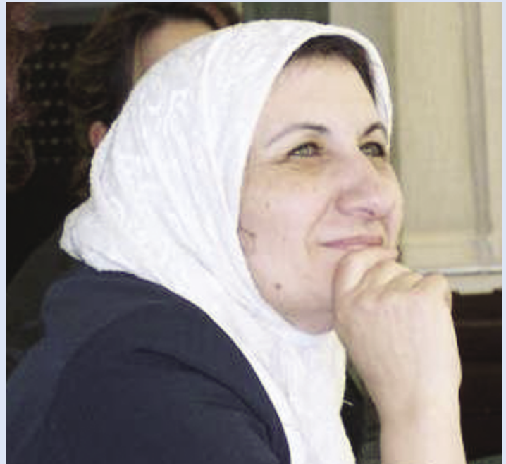
A woman participates in IRI's candidate training in the West Bank.

Leading up to November 2004 municipal elections, IRI