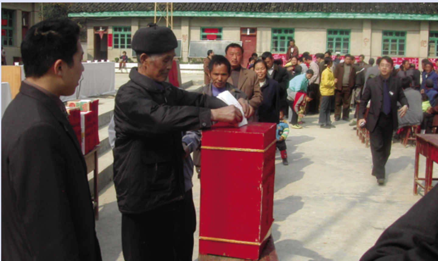
A man casts his ballot during December 2004 village elections in Guizhou Province, China.

project to develop China's first comprehensive regulations on campaigning. In addition, IRI launched a new program with a Tibetan NGO to help rural herders and farmers understand their individual rights.