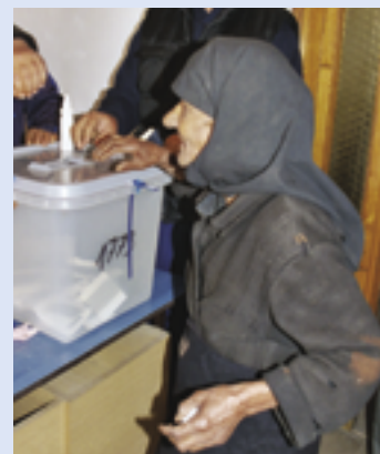
An Albanian woman casts her ballot during Macedonia's April presidential election.

The CJ program evolved into a major reform success story, with CJ members holding a number of senior positions in the Croatian print and electronic media.