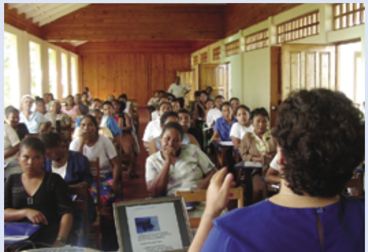
IRI provides political training for women in the Atlantic Autonomous Region of Nicaragua.

IRI and the Institute for Representative Government established a partnership in 2004 to set up a study tour that would allow Brazilian legislators to meet with their U.S. counterparts. The study tour focused on trade and the political decision-making process at the national and state levels.