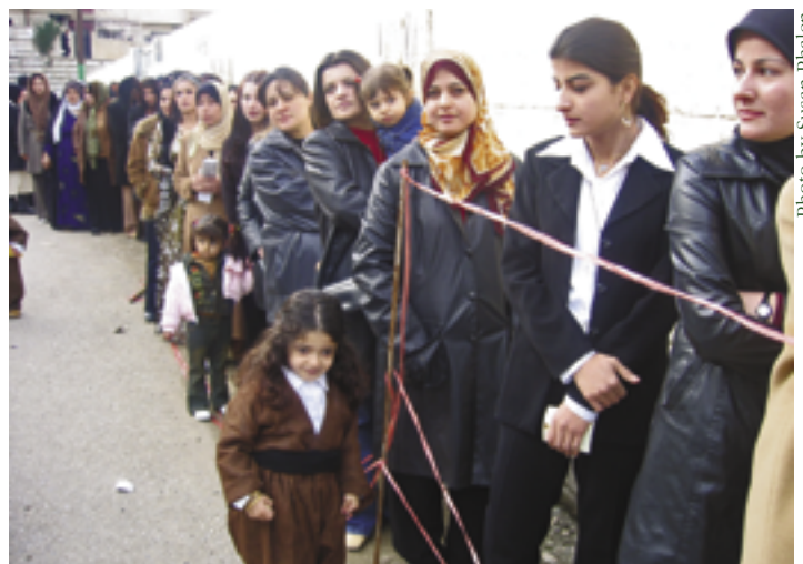
Iraqi women line up to vote during Iraq's historic election on January 30, 2005.

In addition to GOTV programs, IRI trained more than 1,500 representatives from 100 political parties on basic democracy building skills including organization, message development and coalition building. Similarly, IRI trained 2,500 members of