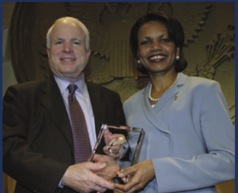
IRI Chairman Senator John McCain presents then-National Security Advisor Condoleezza Rice with the 2004 Freedom Award.

“The IRI has been doing the difficult work that comes with newfound freedom and liberty and democracy... [IRI] helps freedom take root throughout the world,” said Dr. Rice.