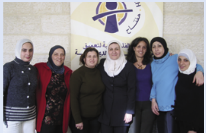
Participants of IRI's December training conducted in the West Bank pose for a photo.

Women in the Middle East and North Africa have new opportunities to seek elected office, but continue to face traditional social and cultural barriers that discourage their full political participation. To increase women's participation in civic and political affairs, IRI launched Partners in Participation (PiP), a program supported by the U.S. State Department's Middle East Partnership Initiative. In 2004, IRI implemented PiP women's campaign schools in Doha, Qatar, and Tunis, Tunisia. The training events taught women from across the region basic skills needed to mount viable electoral and advocacy campaigns.