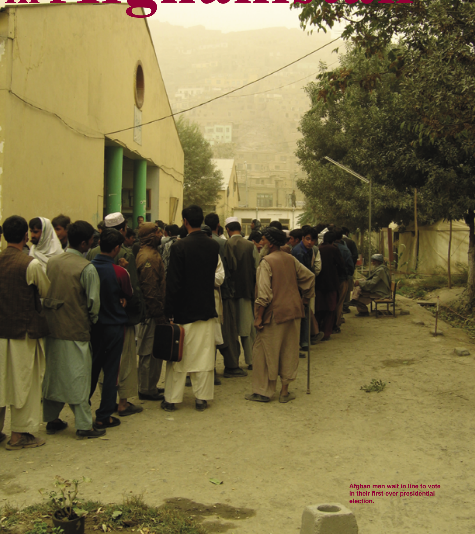
Afghan men wait in line to vote in their first-ever presidential election.