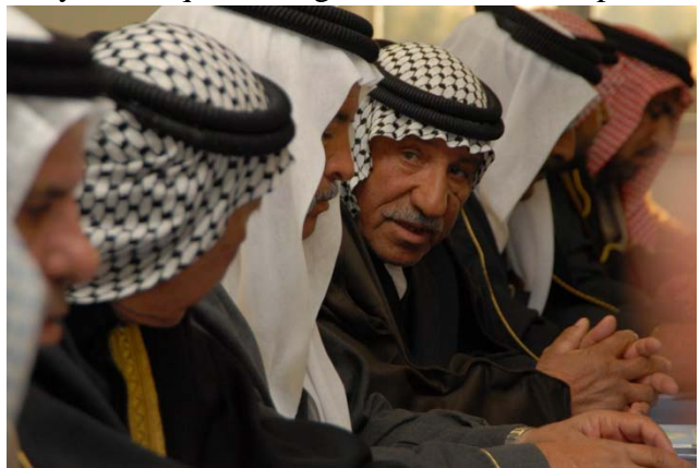
Iraqi sheikhs discuss a common Declaration of Principles at IRI's Tribal Conference in December 2008.

The 2007 Surge owed much of its success to the rebellion of the Sunni tribes of Anbar against the violent radicals in their midst, but in the years since, the same tribal militias that assisted in routing al Qaida have been consistently marginalized by the Iraqi central government. To help in the political integration of the tribes with the rest of Iraq, and to ensure they do not once again turn to violence to meet their political goals, IRI has conducted a number of projects strengthening the capacity of tribes to compete in a modern democracy.