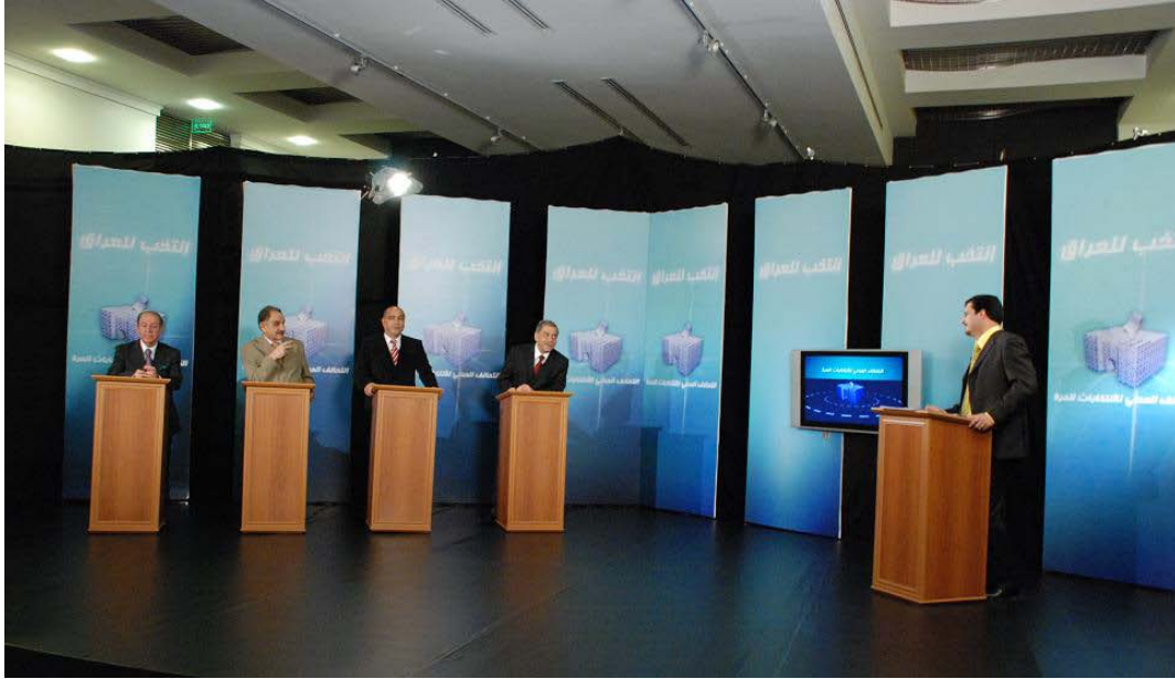
Leading Iraqi politicians participate in a January 2009 televised town hall debate at the IRI Media Center before provincial council elections.

“IRI delivers a kind of science and we are like students. I remember well the training conducted by IRI in Erbil, on on-camera and media communications, and honestly it was very good and helpful for our experience. We all gained experience and confidence in appearing in front of television. I would like to take this opportunity to thank all the efforts by IRI to help us and conduct these trainings, and also I encourage them to do this more and more in order to serve Iraq.”