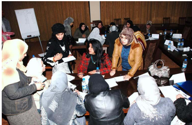
IRI training female political party activists from Basra in January 2009.