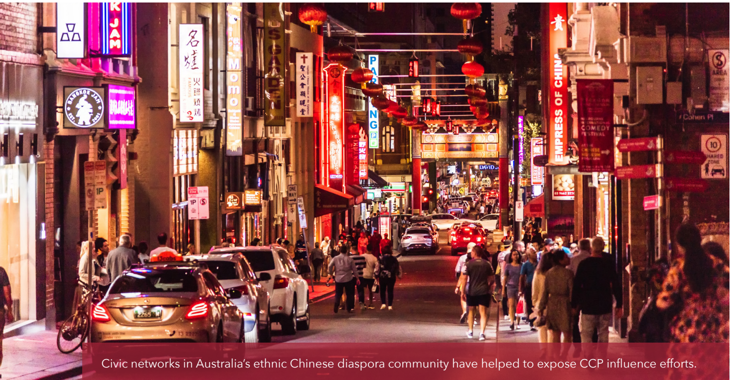
Civic networks in Australia's ethnic Chinese diaspora community have helped to expose CCP influence efforts.

run on a platform criticizing Rajapaksa's deals with China. Despite its skepticism toward Chinese investment, Sri Lanka's new government ultimately determined the country had little choice but to seek further credit from China to finance its debts and complete major infrastructure projects. 6