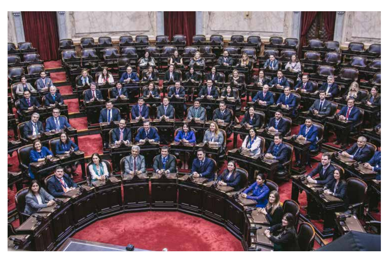
Legislators and staff from across Latin America gather in the Argentine Chamber of Deputies during the Americas Summit for Transparent Legislatures in Buenos Aires.

Legislator Turnover Decreases Retention of Institutional Knowledge: High turnover in parliaments and fragile and/or volatile political situations can limit the implementation of lessons learned, as HDP alums might leave office soon after they participate in programming. Methods to mitigate this challenge are to develop more programming that invests in professional legislative staff, target working with newly elected MPs, and provide assistance that is sensitive to election cycles.