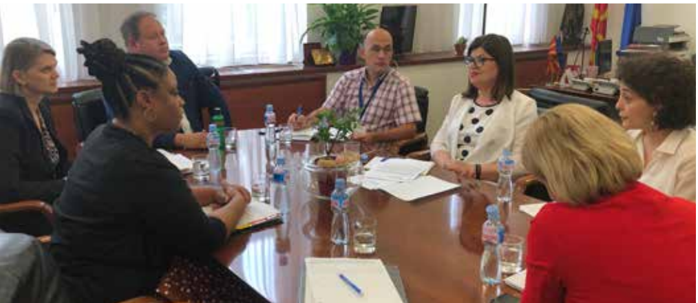
Top: Speaker of the U.S. House of Representatives, Rep. Nancy Pelosi (D-CA), and Chairman of the House Democracy Partnership, Rep. David Price (D-NC), address participants at HDP's 2019 Leadership Forum.

Bottom: U.S. Congress and Congressional Budget Office staff meet with staff of the Assembly of North Macedonia to discuss legislative budgeting and oversight.