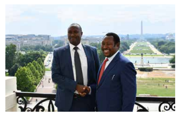
Members of parliament take photo from the U.S. Capitol while in Washington, D.C. for the HDP Leadership Forum.