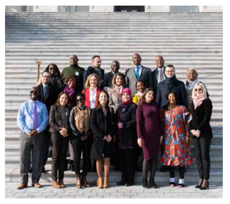
Parliamentary staff from Haiti, Kenya, Kosovo, Liberia and Tunisia pose in front of the U.S. Capitol during a 2018 parliamentary staff institute.