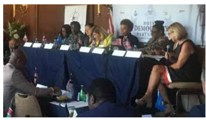
Members of the U.S. Congress, along with members of Parliament from Liberia, Kenya, Kosovo, and Nepal discuss strategies to enhance women's participation in parliaments worldwide.